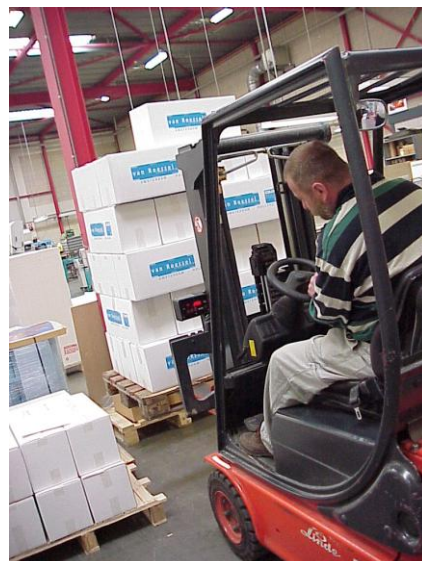
Control of incoming goods during unloading